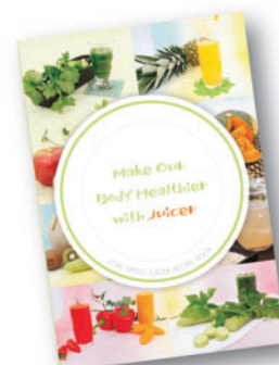
Free recipe book