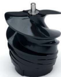
Patented Double Cutting Edged Ultem Juicing Screw