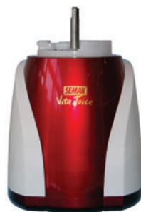
Dessert & Sauce Maker