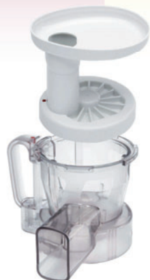
Additional Sauce Making Function