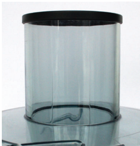
Large 76mm Feeding Chute