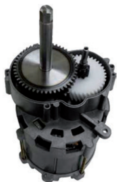
Powerful reducing condensing induction motor slowed to 47 Rpm for gentle squeezing and optimum juice extraction