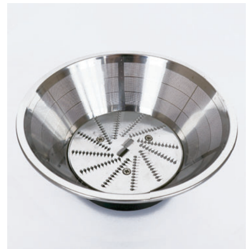
Ultra Efficient Micromesh Filter Basket